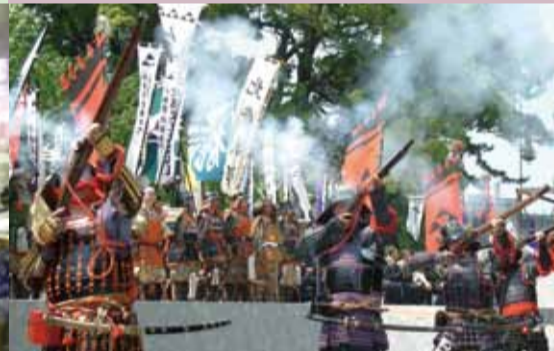
Odawara "Hojo godai" Festival

This festival is to show thanks for the hot water.