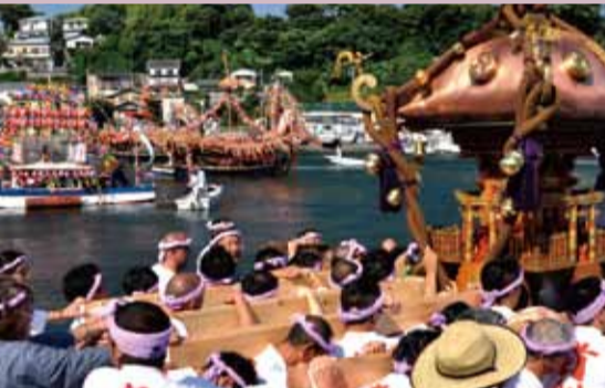
Manazuru "Kibune" Festival

Enjoy a beautiful walk at Mt. Makuyama plum orchard.