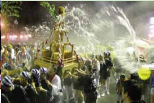
Yugawara "Yukake" Festival

At this festival, prayers are offered for safety at sea.