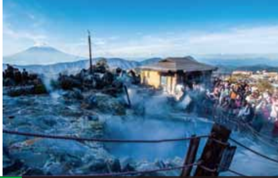
Owakudani (Fumarole Field)

Here, one can observe the last explosion point of the long volcanic activity.