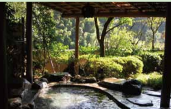
Yugawara Onsen (Hot springs)

Step back in time to the Sengoku era while walking through Odawara-jo Castle Park.