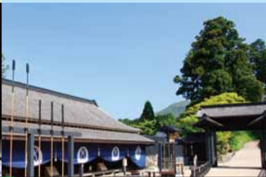
Hakone Sekisho (Checkpoint)

Relax and enjoy health for your body at Yugawara hot spring.